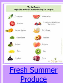
Fresh Summer Produce

The fresh fruits in summer are very cooling and some are even cold in terms of energetic properties, such as watermelon and other melons. Enjoy the seasonal fresh stone fruits of summer such as apricots in early summer, and peaches and nectarines in late summer. Tropical fruits are more readily available now as well, such as pineapple, mangoes and guava (we are finally seeing organic versions of these fruits in local supermarkets too). By middle to late summer, grapes are in season, along with plums and pears.